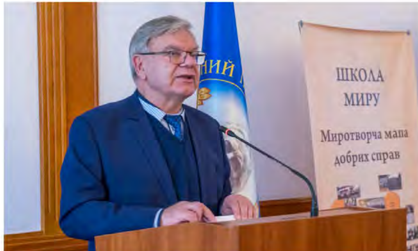
Dr. Vasyl Kremen, President, Academy of Pedagogical Sciences of Ukraine.