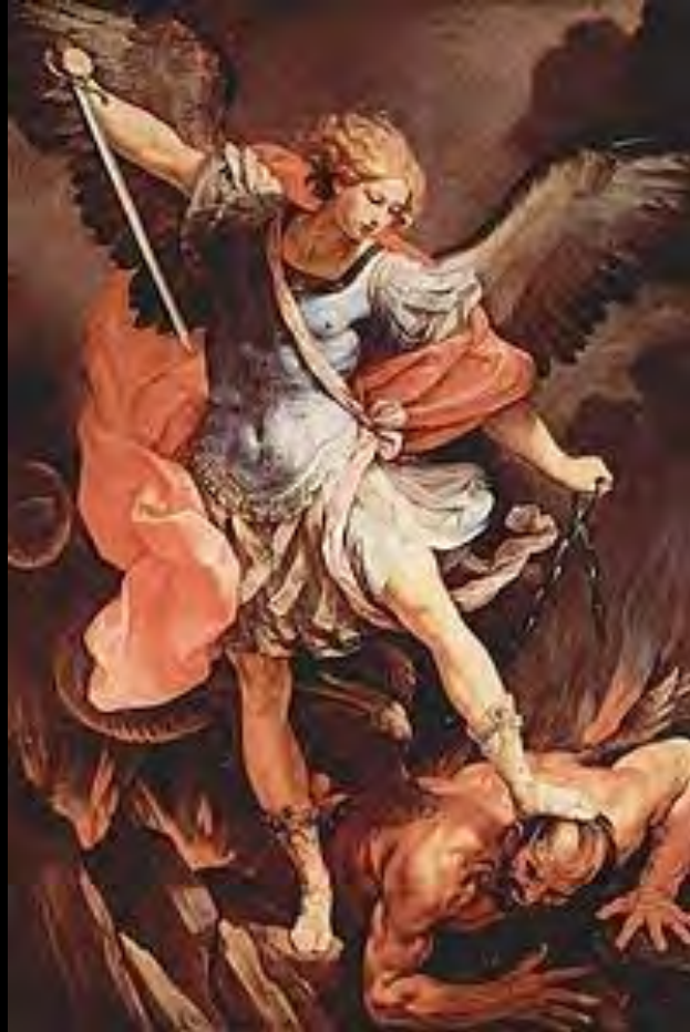
The Archangel Michael wears a late Roman military cloak and cuirass in this 17th century depiction by Guido Reni