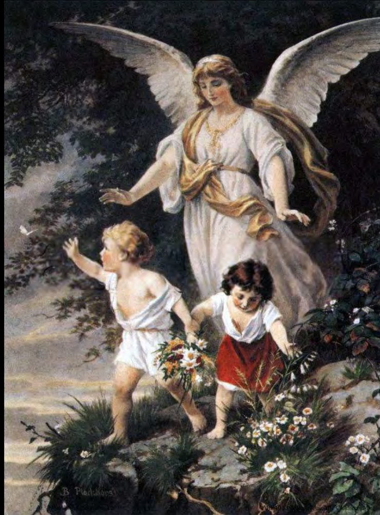
Schutzengel (English: "Guardian Angel") by Bernhard Plockhorst depicts a guardian angel watching over two children