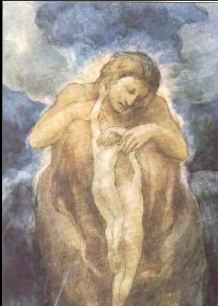
Angel of hope by Kahlil Gibran