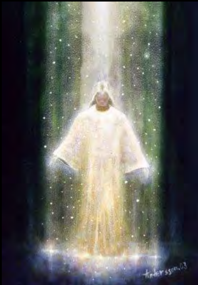
Recense of an Angel Artist Benny Andersson