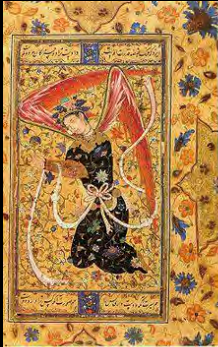
Depiction of an angel in Islamic Persian miniature