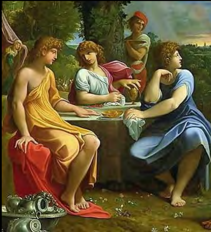
Three angels hosted by Abraham, Ludovico Carracci (1555–1619), Bologna, Pinacoteca Nazionale.