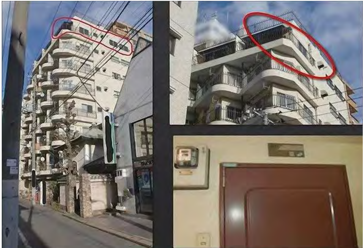
One of the many confinement apartments that existed all across Japan. Here, the location of the 8th floor apartment in Ogikubo, Tokyo where Toru Goto was held captive and dehumanized