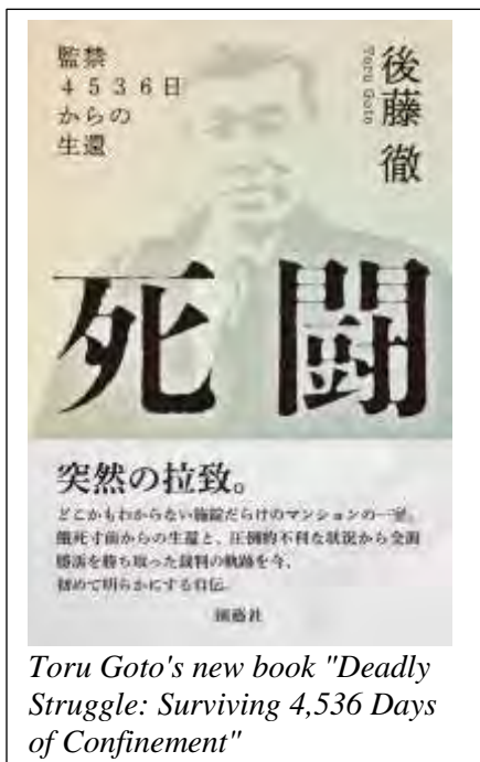
Toru Goto's new book "Deadly Struggle: Surviving 4,536 Days of Confinement"

Victim held locked up for for over 12 years reveals dark reality of orchestrated campaign made up of abductions, forcible detention and dehumanizing faith-breaking