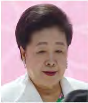
Hak Ja Han 12th April 2025.