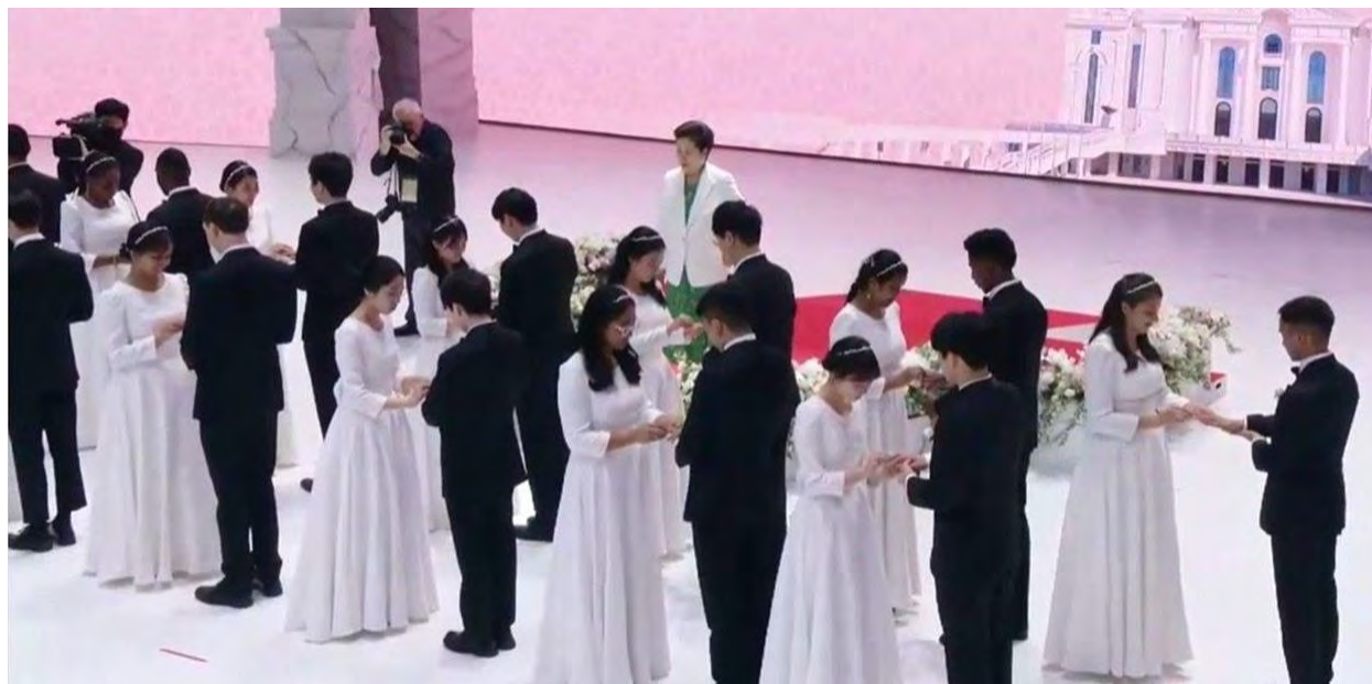
The exchange of Marriage Blessing rings April 12, 2025

Mother Han entered the stage through two lines of "attendants" - couples who had their marriage blessed by her between 2013 and 2024. She began what is called a " Marriage Blessing ceremony" by sprinkling holy water on 13 representative couples in two lines on stage. At the same time, assistants sprinkled holy water on all the couples below the stage and at blessing venues worldwide.