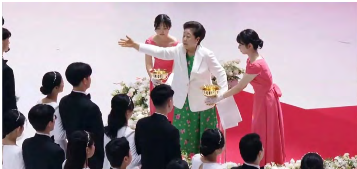
Hak Ja Han , Holy Mother Han, sprinkling holy water on representative couples April 12, 2024

Family Federation hosts massive international Blessing ceremony in South Korea with thousands wed - 5,000 couples