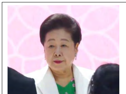
Holy Mother Han officiating at the Marriage Blessing ceremony April 12, 2025

Family Federation hosts massive international Blessing ceremony in South Korea with thousands wed - 5,000 couples