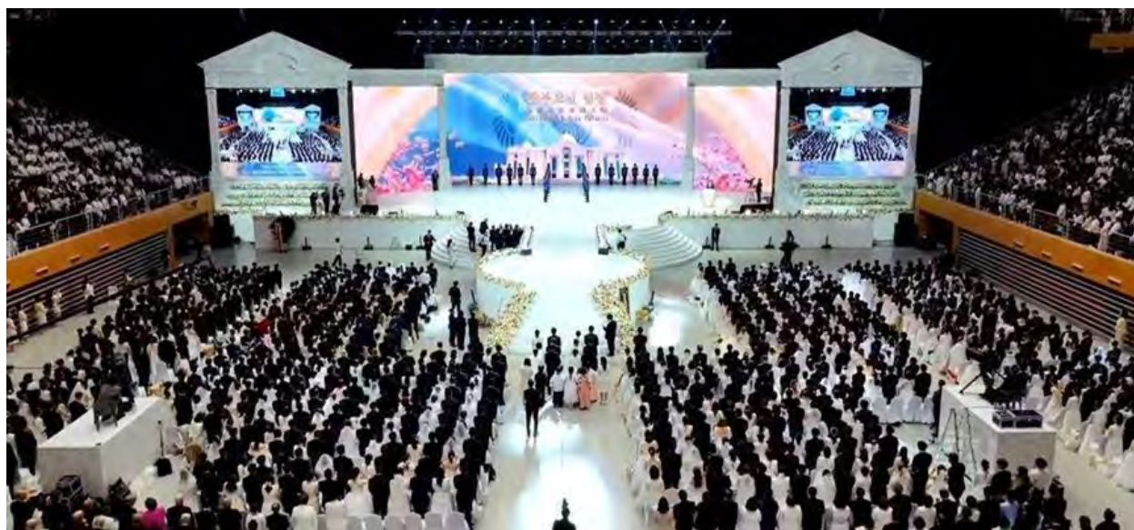
From the Marriage Blessing ceremony in Gapyeong, South Korea April 12, 2025

"I hereby proclaim that the virtuous men and women participating in this 'cosmic' blessing ceremony officiated by the 'True Parents of heaven, earth, and humankind' [See editor's note below] have been joined in holy matrimony before heaven and earth through the grace of Heavenly Parent ( God ) and the 'True Parents of heaven, earth and humankind'." (from simultaneous translation)