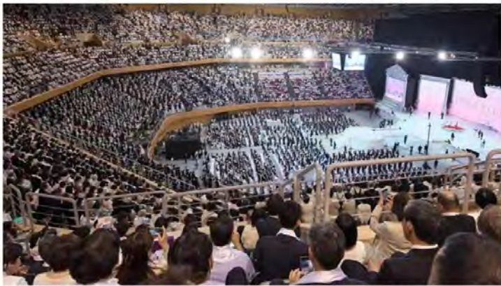
From the "Marriage Blessing Ceremony" 12th April 2025, at the Cheongshim Peace World Center in South Korea.

The Blessing Ceremony was officiated by Hak Ja Han, wife of the late Reverend Sun Myung Moon and President of the Universal Peace Federation (UPF). During the ceremony, participants took part in a "Holy Marriage Blessing Vow" to pledge the building of ideal families, exchanged rings, and were declared by Han to be "Sacredly married before the cosmos," prompting applause and blessings from the crowd.