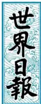
Logo of the Sekai Nippo

by the editorial department of Sekai Nippo