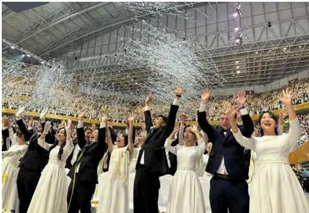
Grooms and brides who participated in the " Marriage Blessing Ceremony " 12th April 2025, at the Cheongshim Peace World Center in South Korea