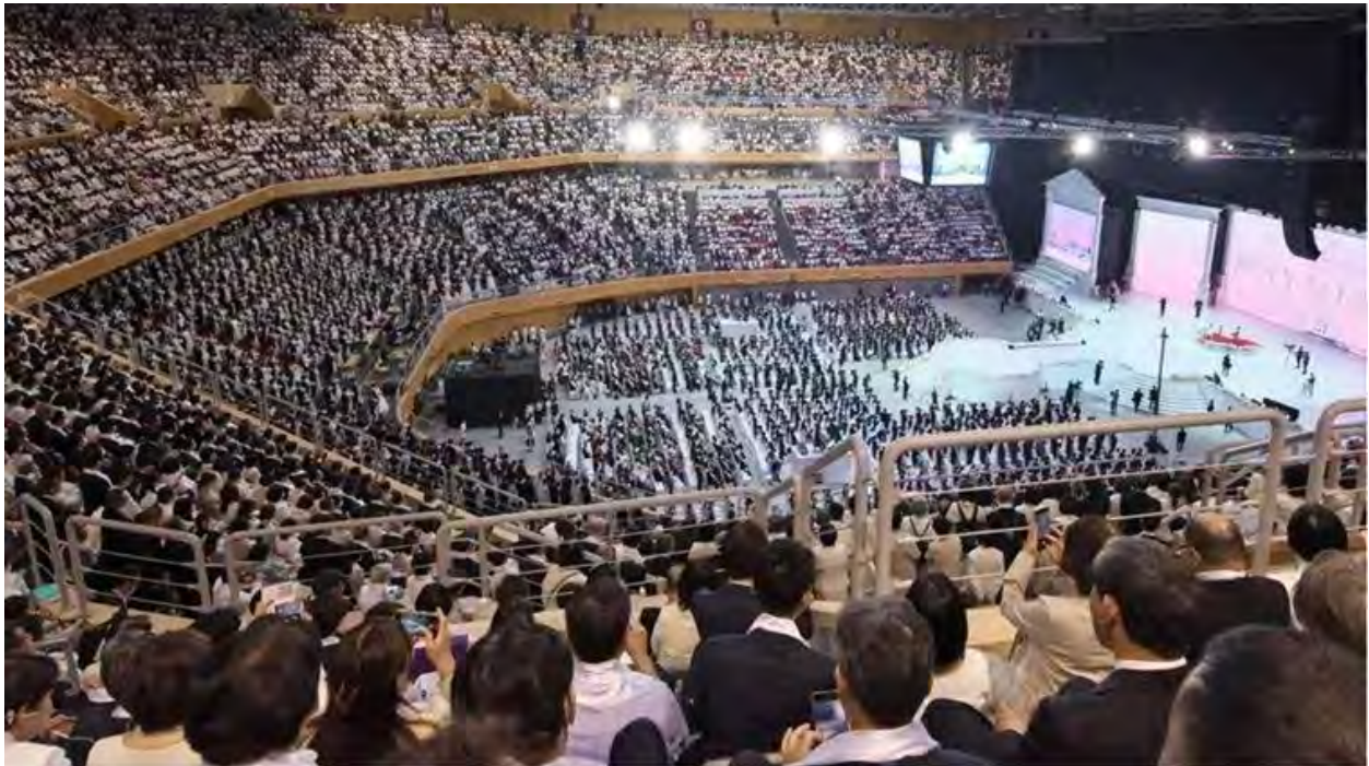
" Marriage Blessing Ceremony " April 12, 2025, at the Cheongshim Peace World Center in South Korea

A Japanese woman who married an American man said happily,