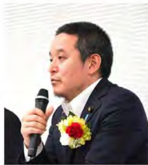
Senator Satoshi Hamada (浜田 聡, House of Councillors, NHK Party) speaking on 26 th January 2025, in Yokohama City, Kanagawa Prefecture, Japan.

Q: Senator Satoshi Hamada (浜田 聡) submitted a written inquiry to MEXT requesting fact-checking regarding this