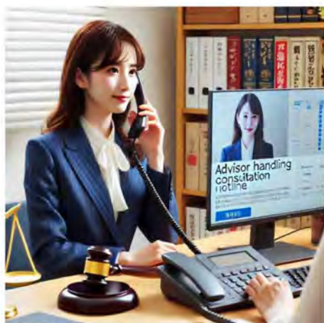
Consultation hotline.

According to the Sankei Shimbun it turns out that less than 20% of the cases handled by the “Spiritual Sales Consultation Hotline” operated by Japan Legal Support Center are associated with the Family Federation . Furthermore, 41% of the monetary disputes involving this organization occurred more than 20 years ago. A critical question is how the Tokyo District Court will interpret the