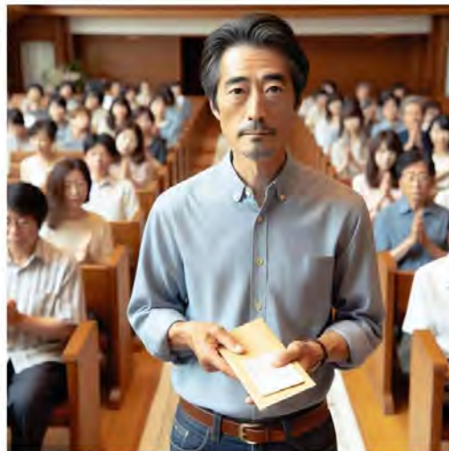
Japanese man offering a donation to support missionary work.