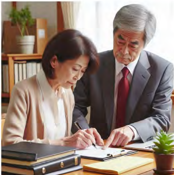
signed and sealed by the