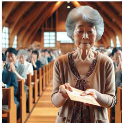
Disputed donations. Here, woman offering donation that her son later wanted refunded.