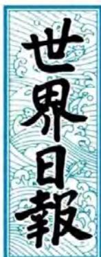
Logo of the Sekai Nippo

Government ministry accused of grave evidence tampering in dissolution case against religious minority the Family Federation