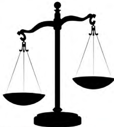
Imbalanced scale of justice.

Using such materials as grounds for dissolution and requesting a dissolution order is clearly an overreach as an administrative act. If a dissolution request can be made based on such unfairly collected evidence, then any "harm" reported by former believers who left their faith or by associates of believers could serve as grounds for dissolution.