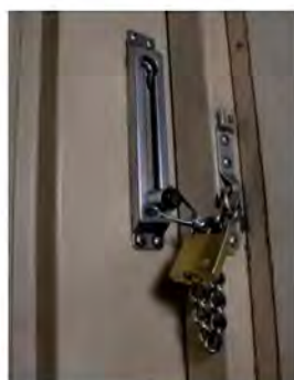
The door was chained.

Historically, these rooms were used for confining family members who were mentally ill, violent, or otherwise considered disruptive or dangerous to the household or community. The practice was more common in the Edo (1603-1868) and Meiji (1868-1912) periods, before modern mental health care systems were established.