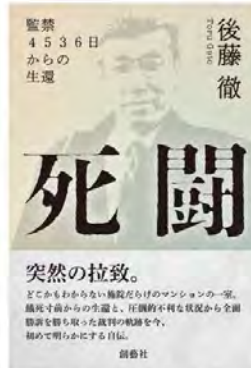
Front cover page of Japanese edition of Toru Goto's new book “Deadly Struggle: Surviving 4,536 Days of Confinement”

On the anniversary of his release, Goto gave a lecture in Sugunami Ward, Tokyo, to mark the publication of his book.