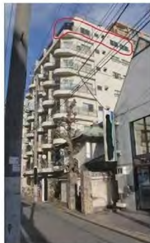
The location of the 8th floor apartment in Ogikubo, Tokyo where Toru Goto was held captive and dehumanized.

The group first headed to Ogikubo, where the apartment he had been confined in was located. As they approached, Goto paused and pointed to the corner unit on the eighth floor, saying, “That is the room where I was locked up for over 10 years. ” He added, “Many believers suffered abduction and confinement in places like this.” The apartment, located in a quiet residential area, had an eighth floor that was difficult to see from the ground, making escape nearly impossible. It was within this very room that the “ worst postwar human rights violation ”, as Goto calls it, took place.