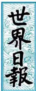
Logo of the Sekai Nippo

Victim of horrendous ordeal – more than 12 years long faith-breaking – suffered hellish existence of mental and physical torture