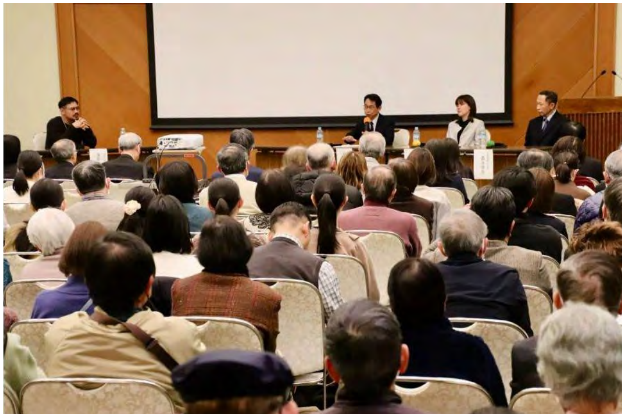
Panel discussion participants February 11, 2025 in Matsuyama, Ehime Prefecture, Japan