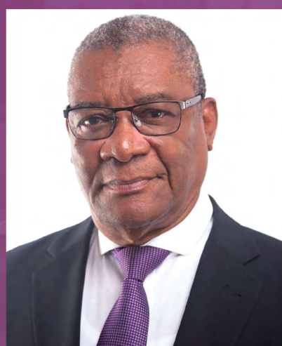
H.E. Evaristo Carvalho President of Sao Tome and Principe (2016~Present)