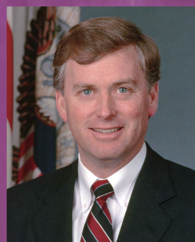
H.E. Dan Quayle Vice President, USA (1989~1993)