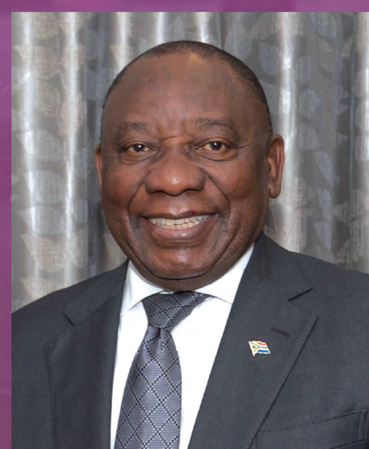
H.E. Cyril Ramaphosa President of South Africa (2018~Present)