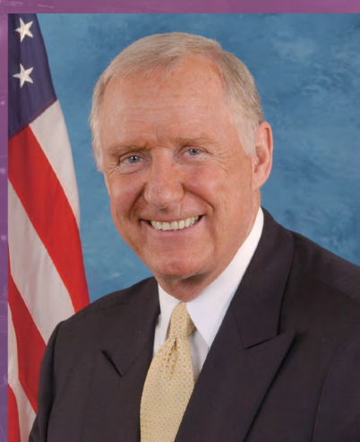
H.E. Dan Burton U.S. Congressman (1983~2013)