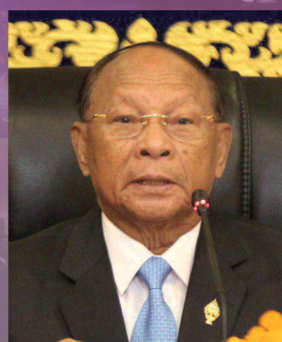
H.E. Samdech Heng Samrin Speaker of Cambodia (2018~Present)