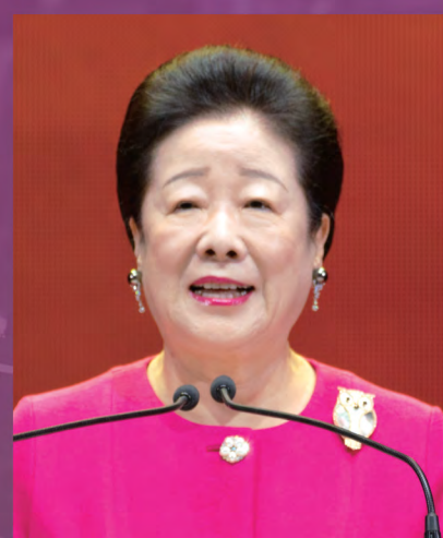
Dr. Hak Ja Han Moon Founder, Universal Peace Foundation