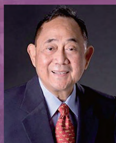
Hon. Jose de Venecia Jr. Speaker of the Philippine House of Representatives (2001~2008)