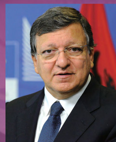
H.E. Jose Manuel Barroso President of the European Commission (2004~2014)