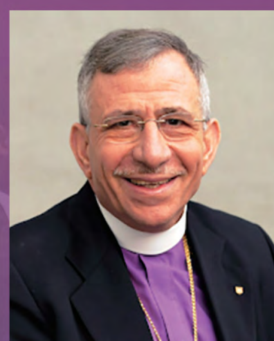
Bishop Munib Younan Bishop Emeritus of the Evangelical Lutheran Church