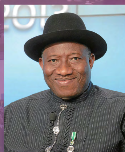
H.E. Goodluck Jonathan President of Nigeria (2010~2015)